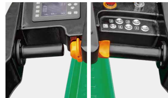
Right and left hand sensing