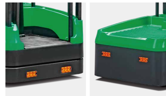
Front and rear flashing lights